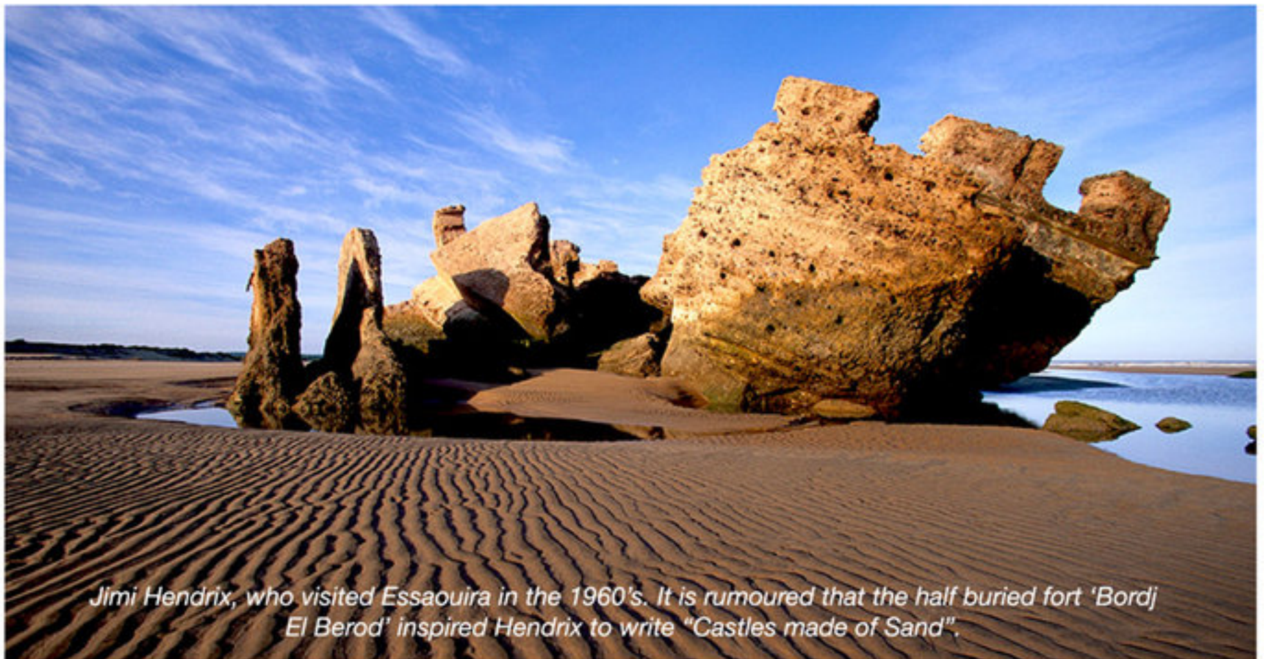
Jimi Hendrix, who visited Essaouira in the 1960's. It is rumoured that the half buried fort 'Bordj El Berod' inspired Hendrix to write "Castles made of Sand".

Essaouira is famous for its myriad shades of blue: blue skies, deep blue sea, blue trawlers and sardine boats loaded with their catch of the day, blue shutters and doors on bright white walls. The story is that the fishing boats in Essaouira are blue so as not to scare the fish!